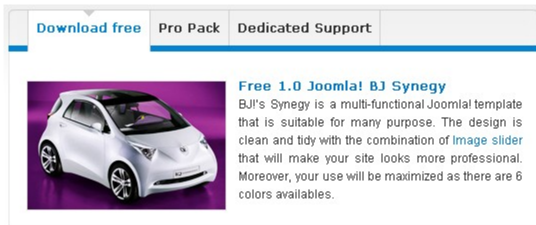
Figure 3. BJ! NewsTabber looks and feels

http://clients.byjoomla.com/browse_products.php?category_id=1